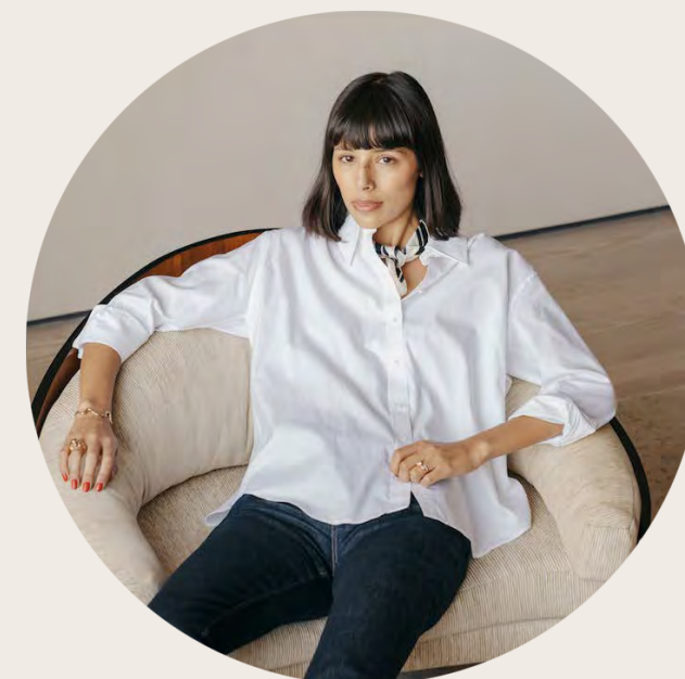
The Career Woman