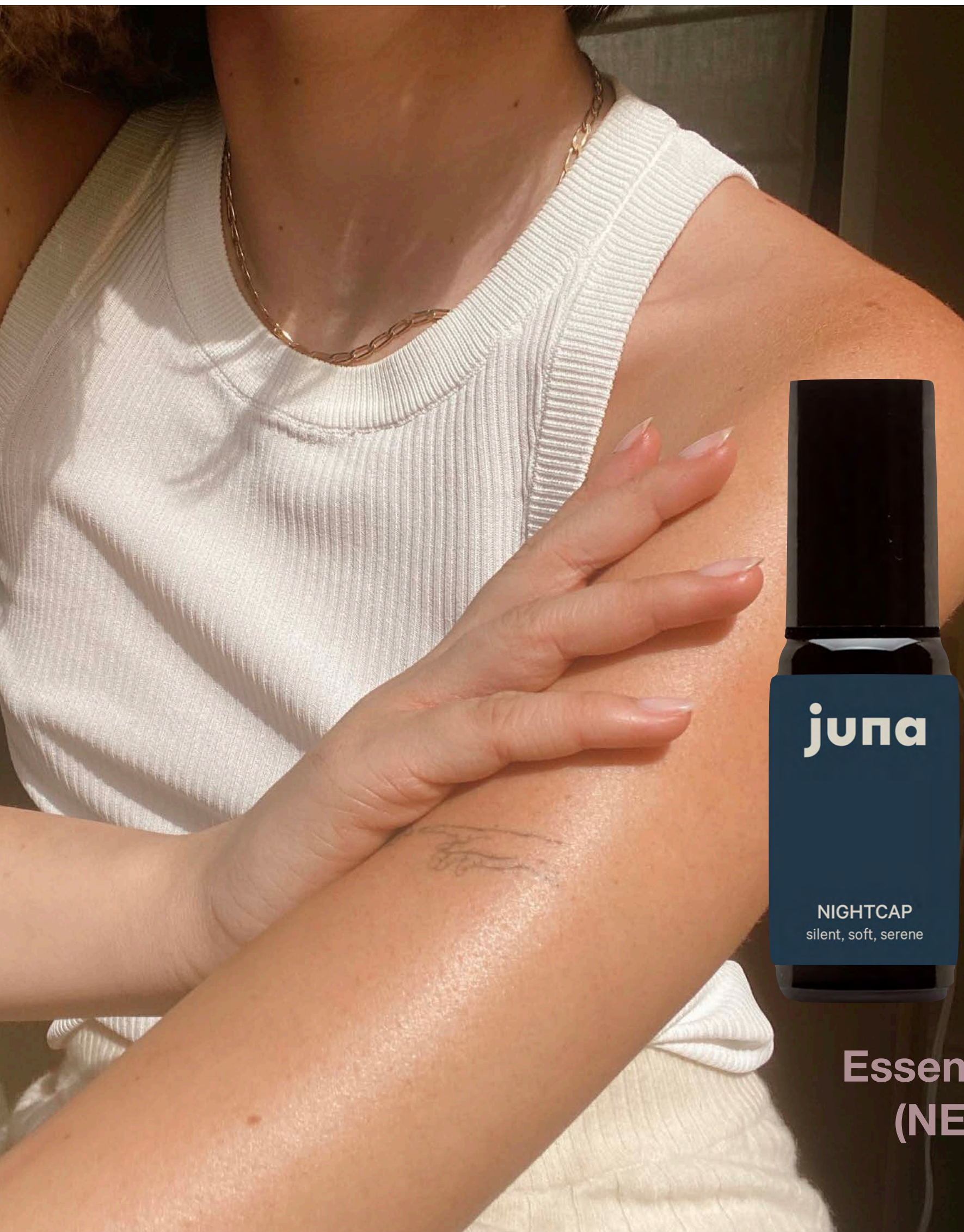
Essential Oil Rollerballs (NEW PRODUCTS)