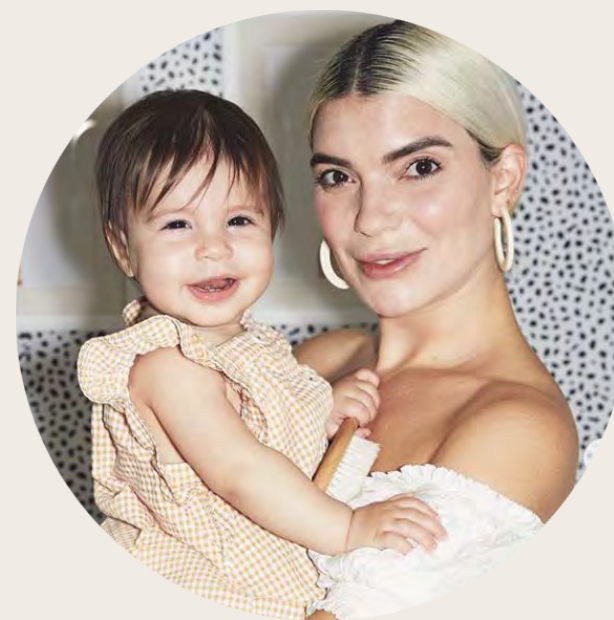
The Urban Mom

Looking for: stress relief, boost mood, sleep support, hormone balance and anxiety and tension release. Overall daily optimization.